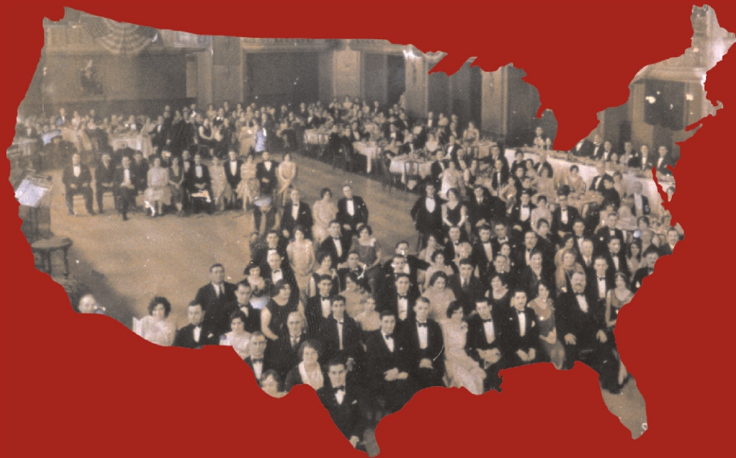
PHOTO EXHIBIT from Nov 3rd 2007 until Feb 3rd 2008 Ellis Island Museum, New York

120 panels tell the story of why, when, how and from where masses of Sicilians emigrated to the United States, as well as the story of their developing relationships in the New World.